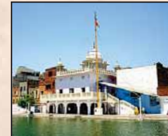
Gurdwara Santokhsar Sahib In memory of Baba Santokh Rai the first holy sarover (nectar pool) of the city