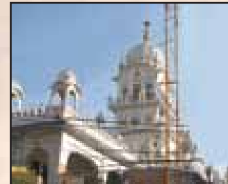
Quilla (Fort) Lohgarh Guru Hargobind (6 th Guru) used a wooden canon in a battle with Mugals at this place