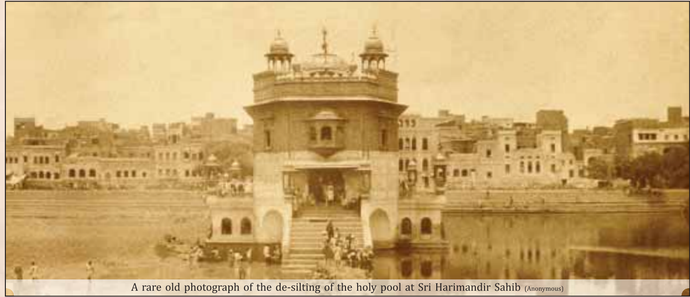
A rare old photograph of the de-silting of the holy pool at Sri Harimandir Sahib (Anonymous)