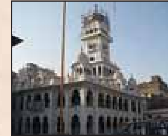
Guru Ke Mehal Birth Place of 9 th Guru (Master) Guru Teg Bahadur Sahib at Guru Bazar (walking distance)