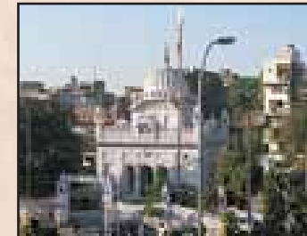
Gurdwara Saragarhi in the memory of 21 Sikh Soldiers, who fought with the Afgan invaders at North-West Frontier