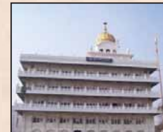
Gurdwara Ramsar Sahib Guru Granth Sahib (Holy Book of Sikhs) was compiled at this place by Guru Arjan Dev Ji in 1604 A.D.