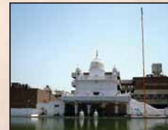
Gurdwara Bibeksar Sahib in the memory of Sixth Guru, Guru Har Gobind Sahib Walking Distance