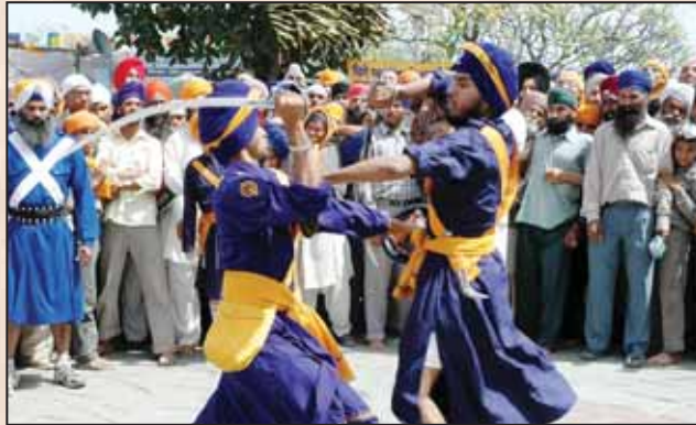
A display of Sikh Marchal Art (Gatka)