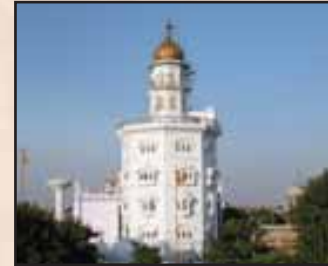
Gurdwara Baba Attal in the memory of Baba Atal Rai Son of the Sixth Guru, (Golden Temple Complex)