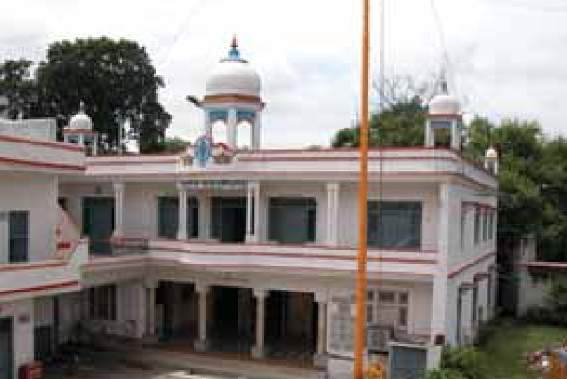
Gurdwara Singh Sabha Laltara Bridge, Haridwar