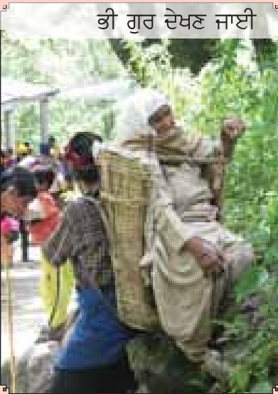
ਭੀ ਗੁਰ ਦੇਖਣ ਜਾਣੀ

ji was manifested in Samvat Nanakshahi 469 (August-Sep., 1937 A.D.)